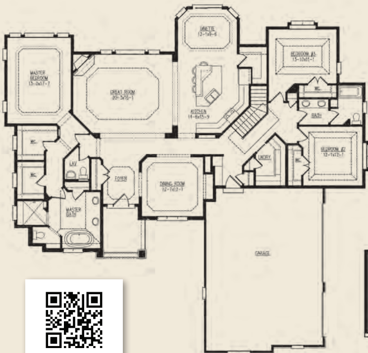
Main Floor 2,528 Sq. Ft.